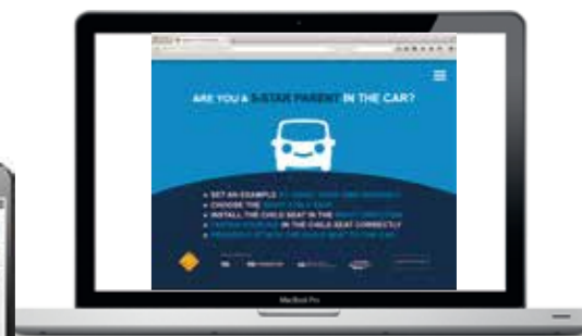
Responsive design website